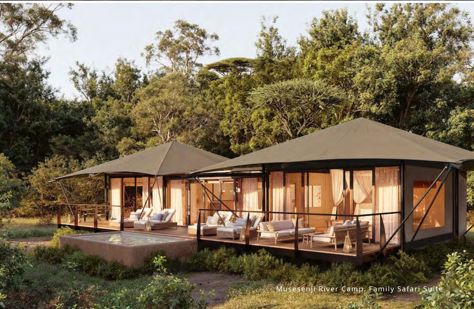
Musesenji River Camp, Family Safari Suite