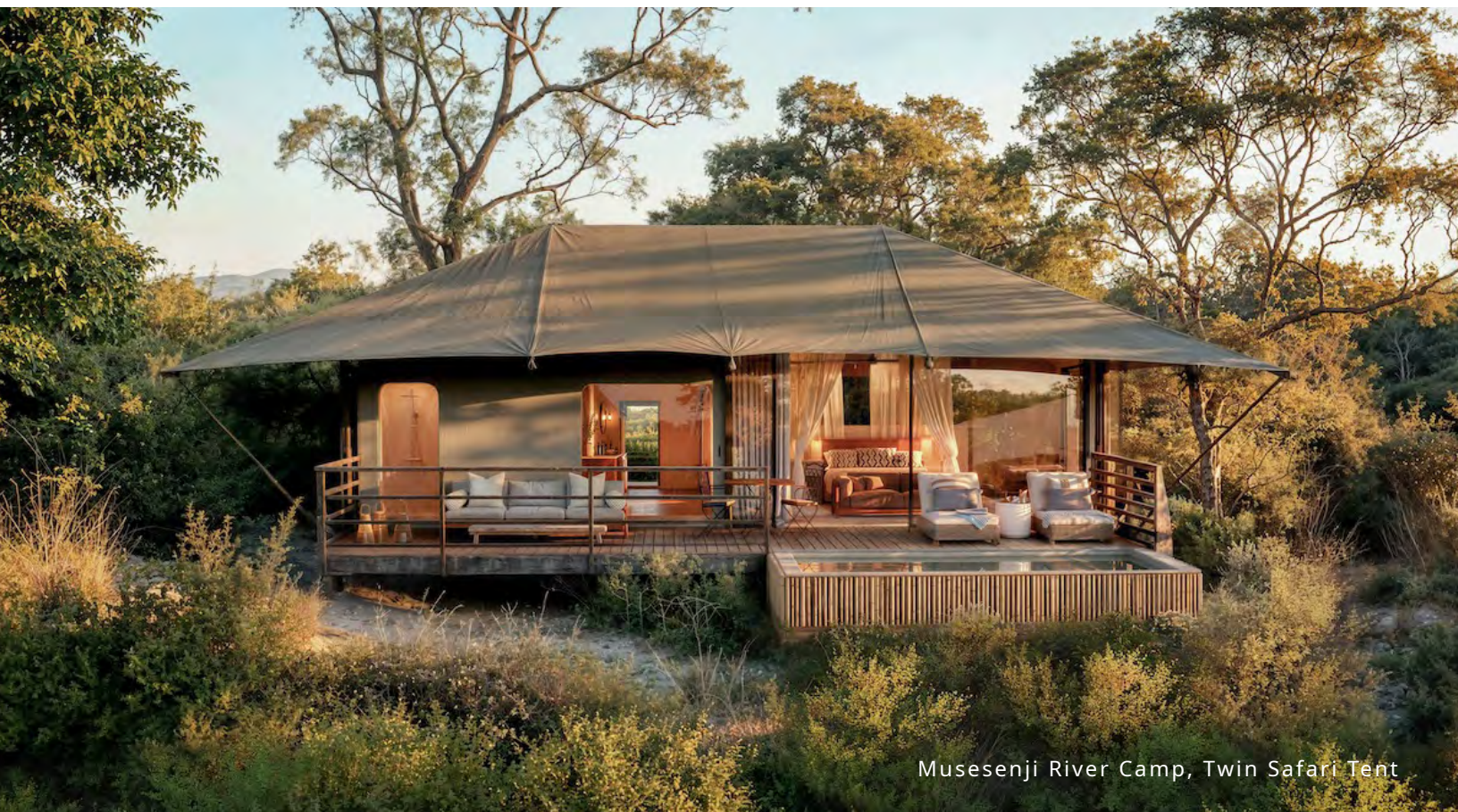
Musesengi River Camp, Twin Safari Tent

Just minutes eastward from Kulefu Airstrip, and together with our new aircraft, we seamlessly connect guests with our King Lewanika Lodge in Liuwa Plain and many other Zambian safari highlights.